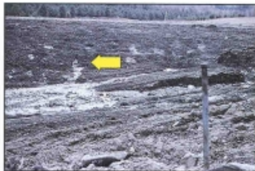
A spring discharging at the downstream toe of an embankment.