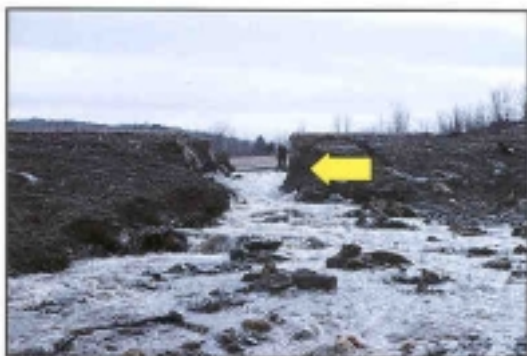
. . . and later the dam failed!