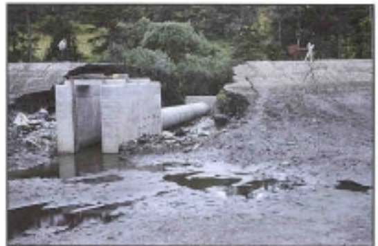
Failure of an earth dam by internal erosion along concrete outlet pipe.