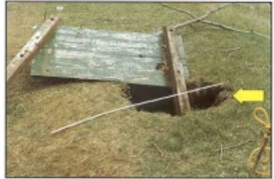
Sinkhole on the crest of an earth dam. The reservoir was lowered, and a 10-foot-diameter cavity was found under the sinkhole.