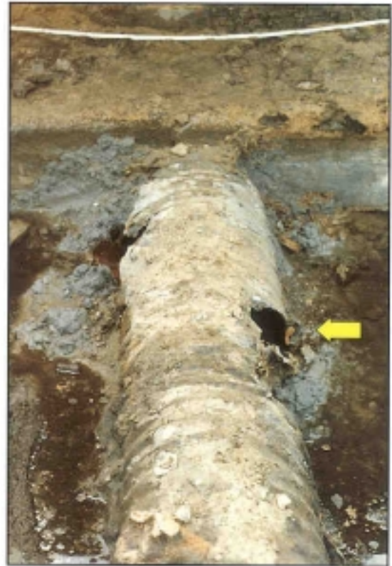
Corroded corrugated-metal outlet pipe removed from a dam that had developed large sinkhole.