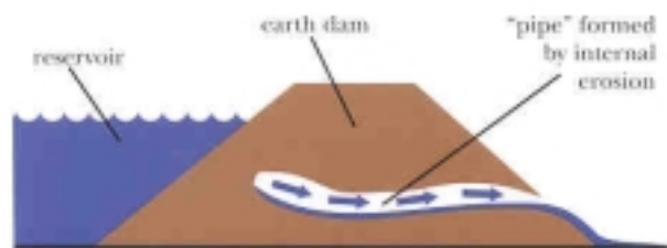
Schematic view of internal erosion in an earth dam embankment.

Internal erosion usually takes place in episodes of erosion and discharge of muddy water interspersed with periods of clear-water discharge or no discharge at all. Internal erosion may be taking place even if there is no visible discharge of water or if the water that is discharging from the soil on the downstream side of a dam is not muddy.