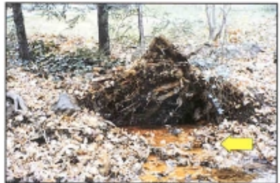
Spring (rust-colored water) that developed where the root ball of a tree pulled out of the ground near the downstream toe of a dam.