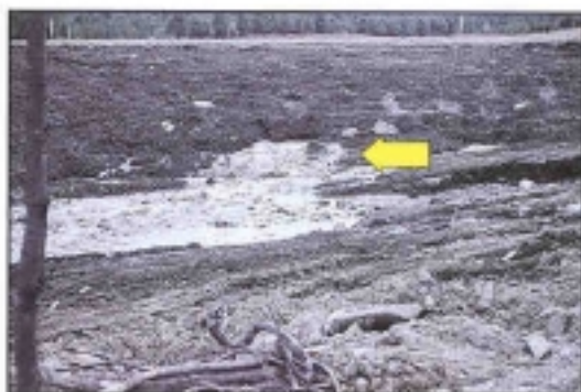
Within two hours, the spring became much larger . . .