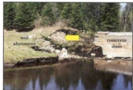
Failure at a concrete dam caused by internal erosion of the soil abutment (shown at arrow).